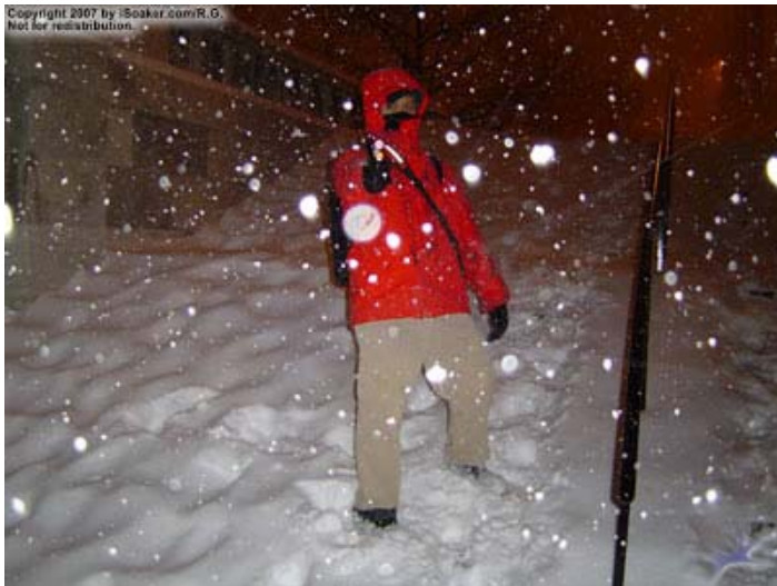
∴ Lots of Ammo; Wrong Format

Maintaining a base level of activity through the Off-Season months has always been a challenge. Of course, this time with lower forum activity means that a little more time can be devoted to overall site maintenance issues and upgrades. Of course, having a silent forum is not desirable, thus activity is sustained through a higher level of off-topic thread creation combined with non-water-warfare threads on subjects like soaker buying, repair, and thoughts of the future. Oddly, few enjoy a good ol' wintery-waterfight.